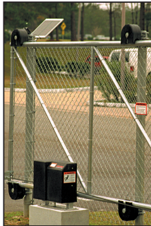
Gate Operator