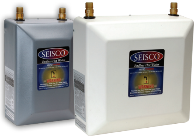
Two & Four Chamber Models Shown

Thermistor Temperature Sensing -Five thermistors continuously monitor inlet/outlet water temperature and the water temperature in each heating element chamber. Outlet water temperature is factory set to 120°F and is field adjustable between 90-130°F. In addition, water flow is sensed using the same thermistors, eliminating the need for troublesome flow switches.