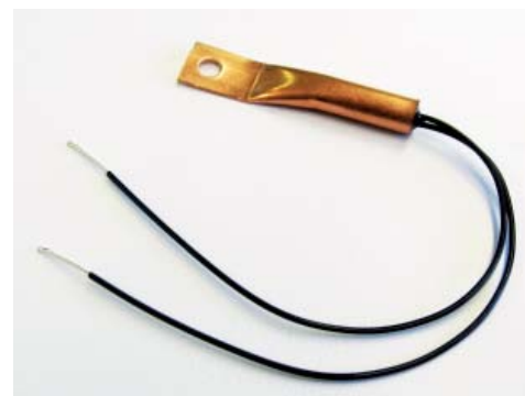
Figure 1.4.-1 SAS-10 Sensor

The function switch on the right side of the controller should be set in the center, 'AUTO', position for automatic pump control. When the switch is in the 'ON' position, Relay 1 will be on continuously, regardless of temperature difference. With the switch in the 'OFF' position, Relay 1 will remain off.