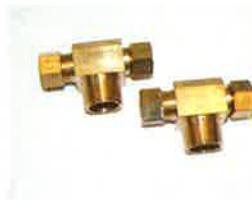
(Custom 1/2"compression x 3/4" MIP x 1/2"compression Pre-Fab T's)