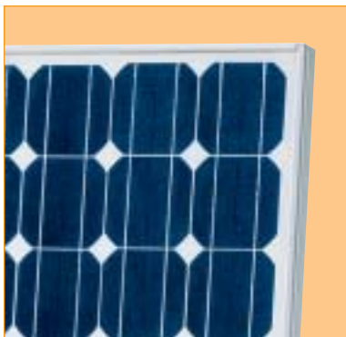
Solder-coated grid results in high fill factor performance under low light conditions.