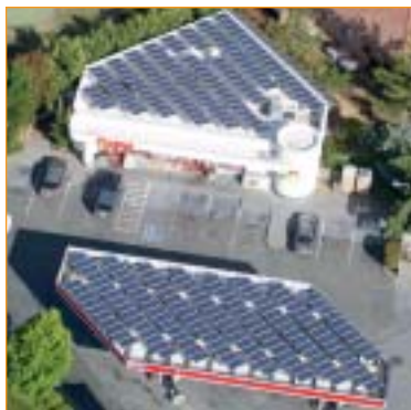
Sharp multi-purpose modules offer industry-leading performance for a variety of applications.