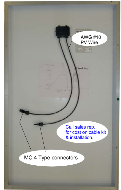
Installed by Ameresco

Connection To Terminal Strip: Soldering AWG #10 PV Wire Pair to both (+) & (-) terminals. Use AWG #10 PV Wire (UV Resistant)