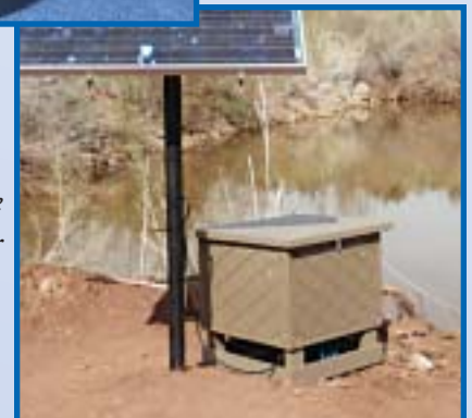
Solaer™ Lake Bed Aerator

! Installation was a cinch and the thing works any electricity, EVER."