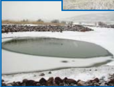
SB-4 at Wolf Springs Ranch