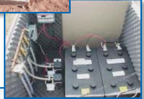
SB-4 with 4 Valve Manifold