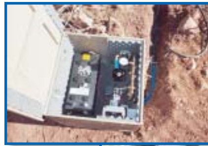
SB-2 with Desert Cooling Package